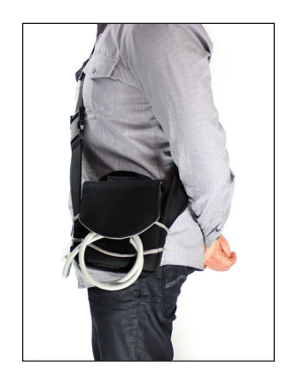
Downsized driver is easier for patients to manage and is more comfortable.