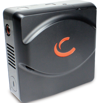
Prototype of new Driver.

Early last year we shared that we were targeting the end of the second quarter 2012 to demonstrate feasibility of our completely implantable system. We are very pleased that we expect to accomplish this goal by the end of the second quarter 2011. We have two physicians from our current sites that are confirmed to participate in the feasibility testing of this system. To see a future with a "Sync-Pulse" system that can connect to a pacemaker and be able to transmit the power through the skin with no cables or drive lines is truly exciting. Look for more news on this late second quarter.